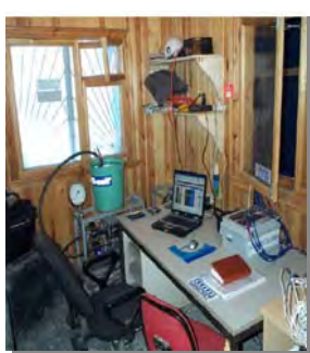
Testing monitored and controlled from inside a heated cabin

Despite snow and freezing weather conditions, all of the testing programs were successful. The effective mobilised capacity in each of the test piles was carried out to the desired maximum loading, and upon request taken to higher loads; in the case of plot 13, the piles were tested to twice the required capacity. Total mobilised capacities were in excess of 40MN on Plots 9 and 10, and capacities of over 60MN were achieved on Plot 13.